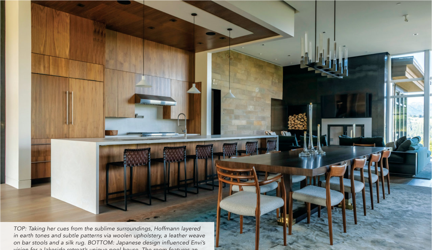
TOP: Taking her cues from the sublime surroundings, Hoffmann layered in earth tones and subtle patterns via woolen upholstery, a leather weave on bar stools and a silk rug. BOTTOM: Japanese design influenced Envi's vision for a lakeside retreat's unique pool house. The room features an infinity-edge pool, soaking tub, custom furniture and Venetian plaster walls. >>