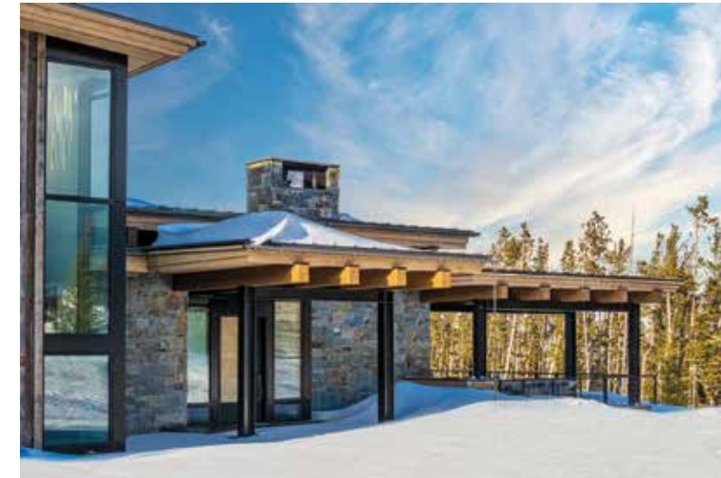
The thoughtful architecture takes advantage of the slope and existing trees to nestle the home into the landscape.

In the downstairs billiards area — where a custom floating bar of walnut hangs from cables in front of floor-to-ceiling windows — Hoffmann worked with Juniper Books to design a collection of custom book