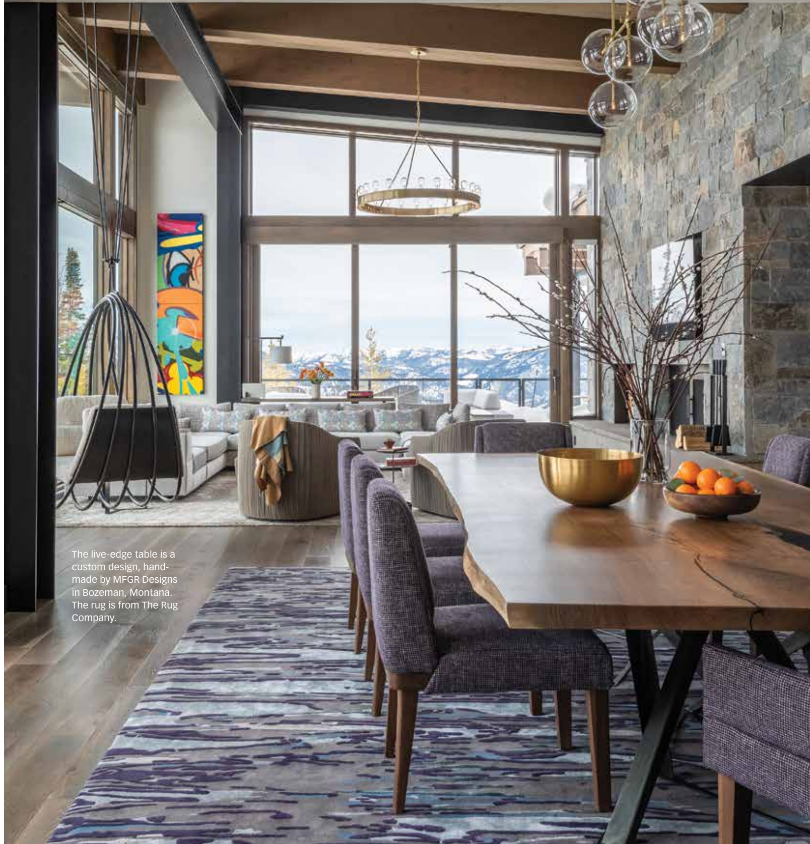
The live-edge table is a custom design, hand-made by MFGR Designs in Bozeman, Montana. The rug is from The Rug Company.