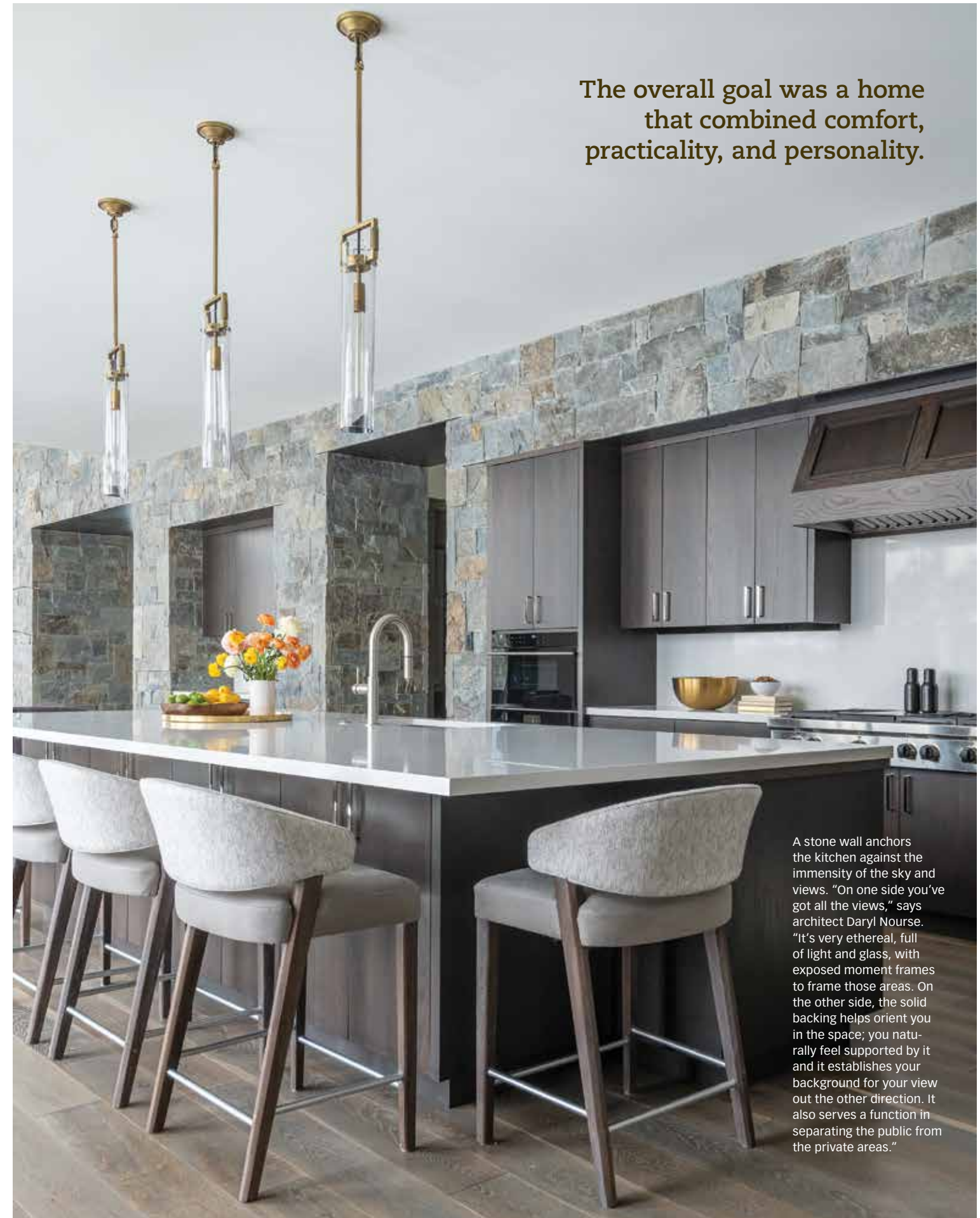
A stone wall anchors the kitchen against the immensity of the sky and views. “On one side you’ve got all the views,” says architect Daryl Nourse. “It’s very ethereal, full of light and glass, with exposed moment frames to frame those areas. On the other side, the solid backing helps orient you in the space; you naturally feel supported by it and it establishes your background for your view out the other direction. It also serves a function in separating the public from the private areas.”

The overall goal was a home that combined comfort, practicality, and personality.