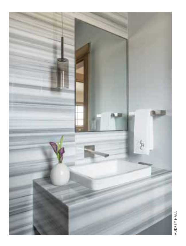
Marble, used for the walls and vanity, makes a dramatic contemporary statement in this bathroom.

Hoffmann says that the feel of the room also can be developed % \left\{ \mathbf{r}^{\prime}\right\} =\mathbf{r}^{\prime}