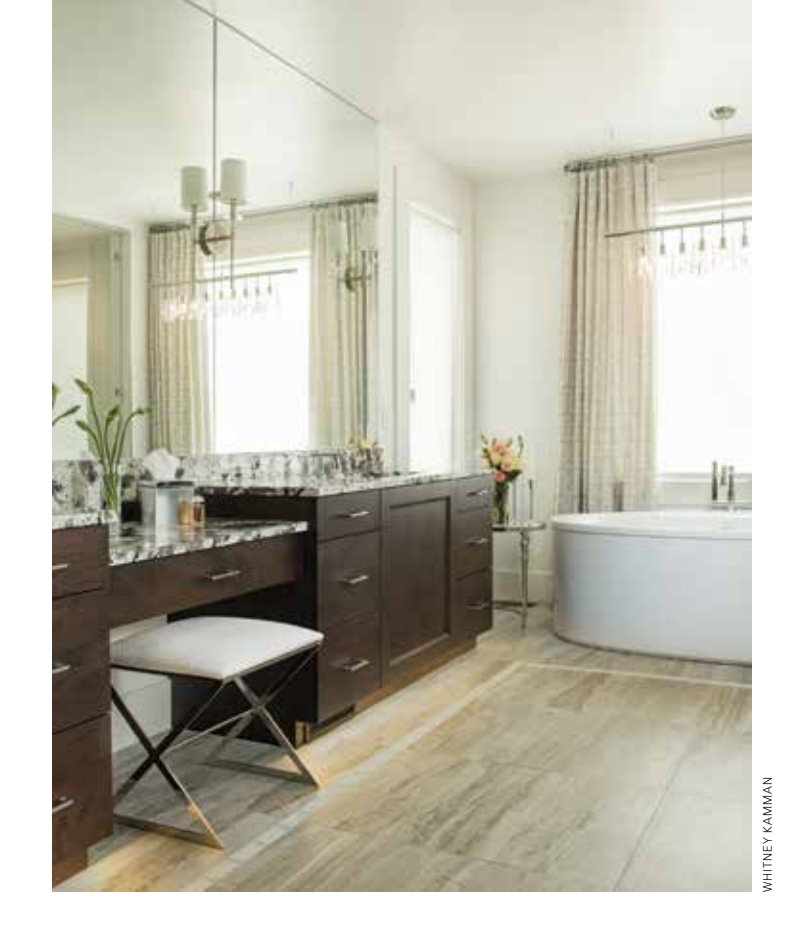
According to Sophia Cok of Sanctuary Interior Design, drapery adds an additional lux option to a master bath. This master bath includes floor-to-ceiling fabric on the windows that contrasts well with the hard surfaces of the countertop and floor. The inset tile border on the floor adds a subtle level of detail.

Cok taps into the functional elements by using illuminated mirrors to add a sophisticated touch and to serve both practical and decorative purposes with a high-end aesthetic. Cok and